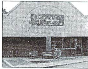
The Grand Union supermarket is set to close November 29.